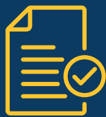
Installment Payment Plan (IPP)