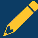
Student Success Centers (Tutoring)