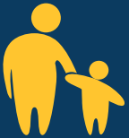
Child Care Assistance