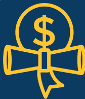
San Jac Scholarships and Grants