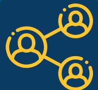
Ways To Connect