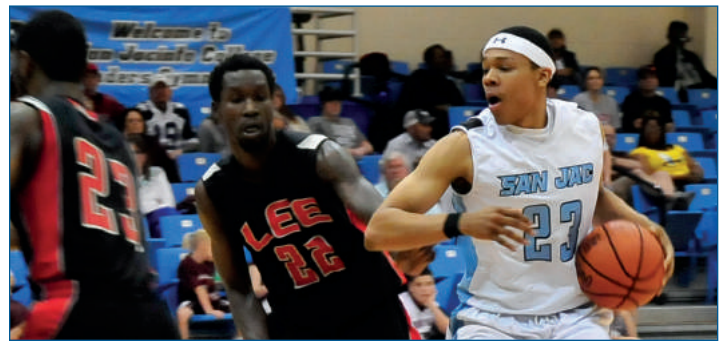
With 12 national championships in its almost 60-year athletic history, San Jacinto College has a long and rich tradition of athletic success. This excellence has brought national and international exposure to the College and local community.

San Jacinto College, or San Jac as it is known in athletics, offers opportunities for male and female student-athletes through two National Junior College Athletic Association (NJCAA) Division I teams: baseball and softball.